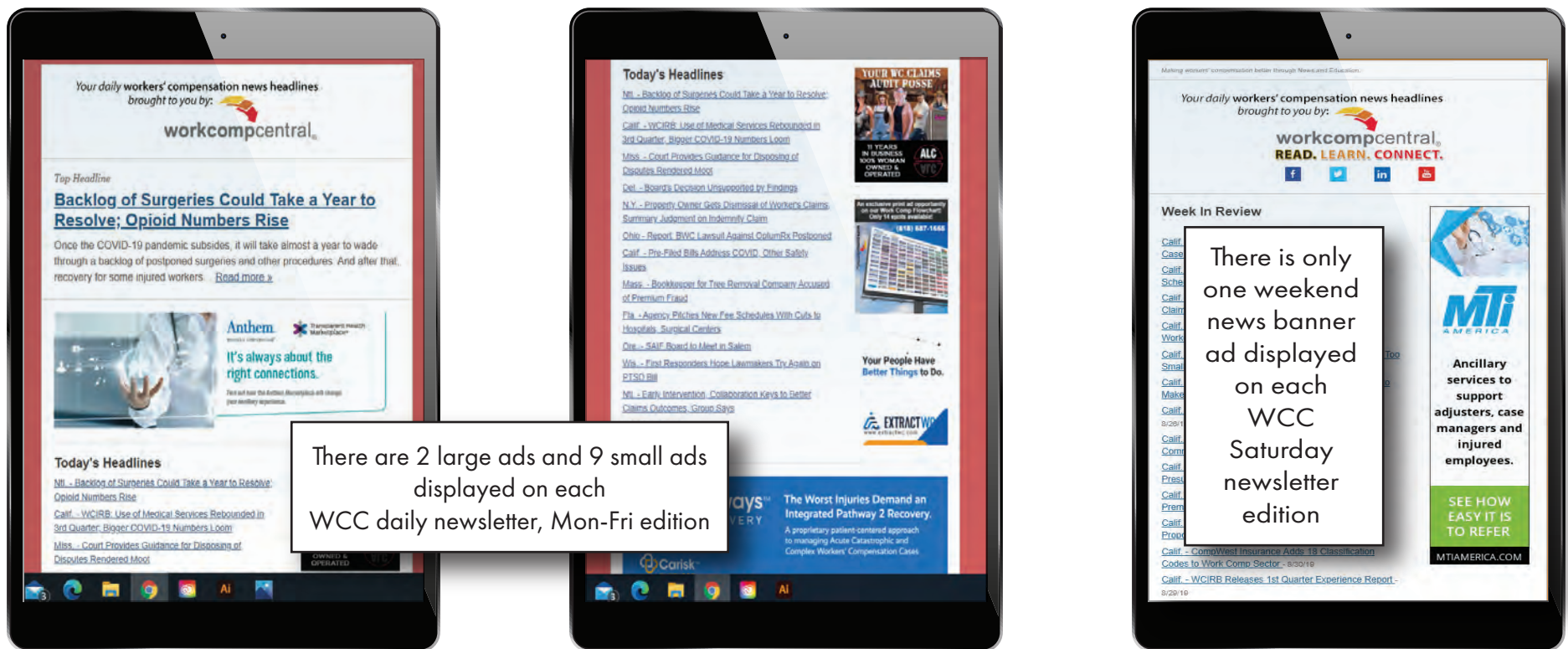
580x180 px Large & 185x200 px Small newsletter banner ads